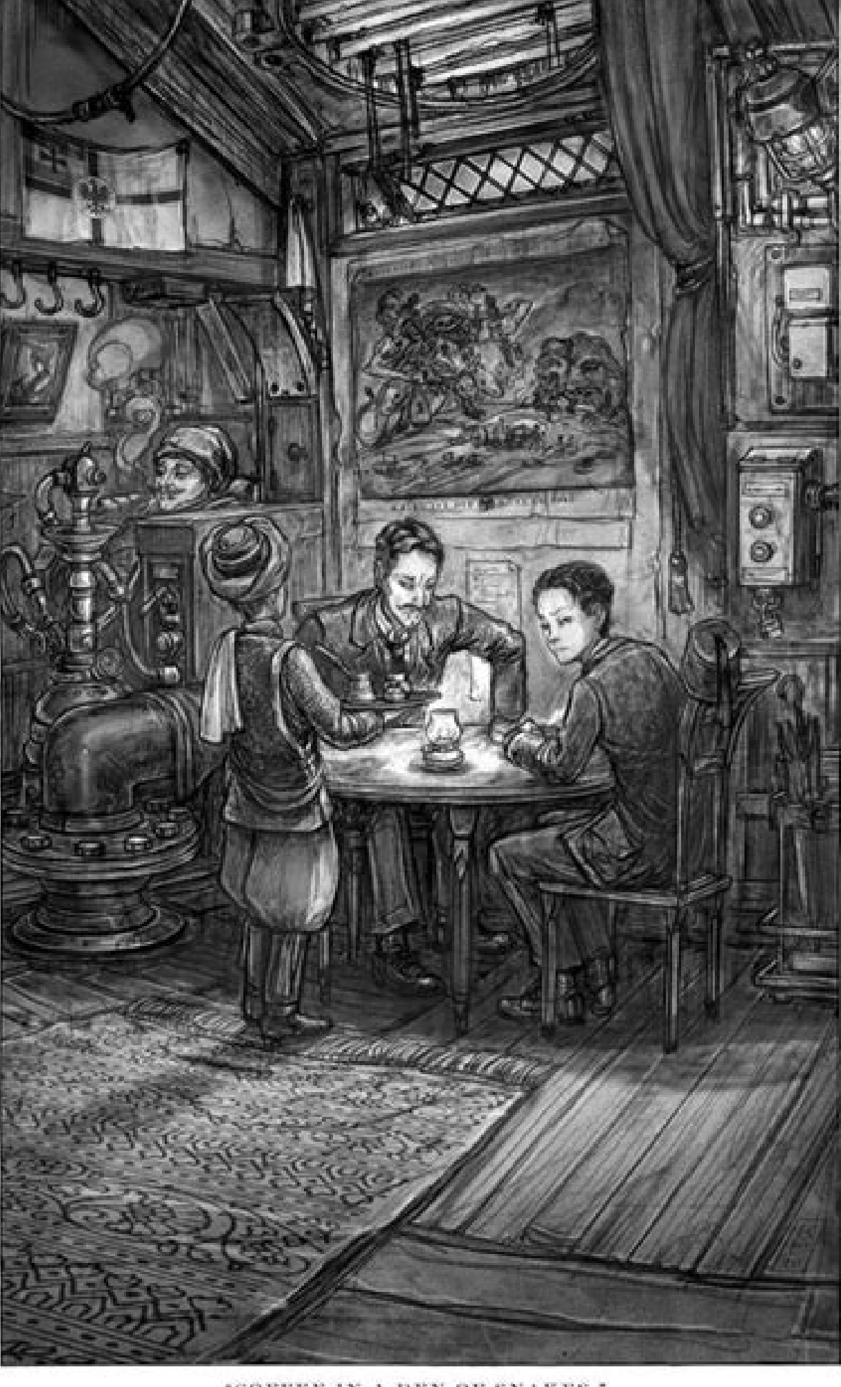
*COFFEE IN A DEX OF SNAKES.*